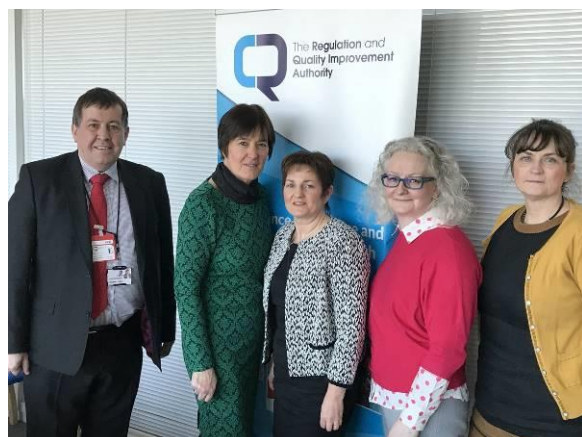
Colleagues from NMC (left) and Care Inspectorate Scotland (right) with RQIA